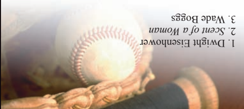
3. Wade Boggs 2. Scent of a Woman 1. Dwight Eisenhower